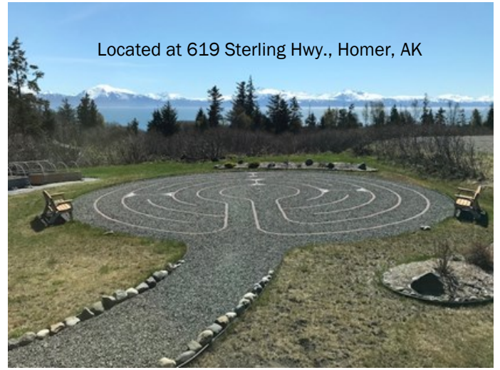
Located at 619 Sterling Hwy., Homer, AK

Plan your next special event indoors in our beautiful sanctuary with a view of Kachemak Bay and the surrounding mountains.